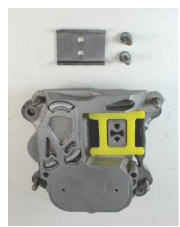
Figure 3: Insert PFF3-726