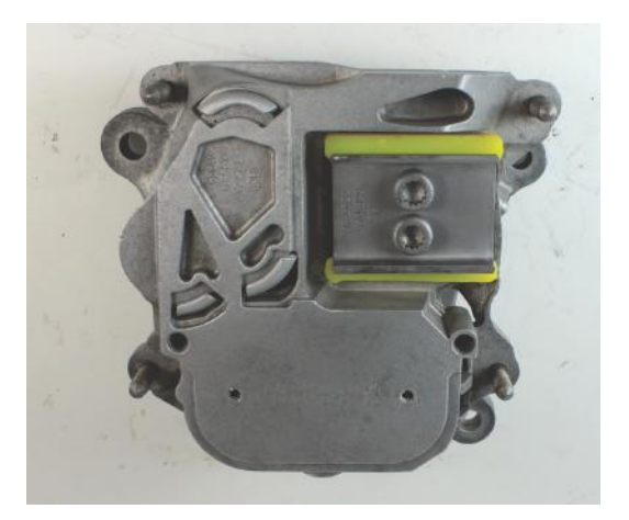
Figure 4: Replace mount plate and screws